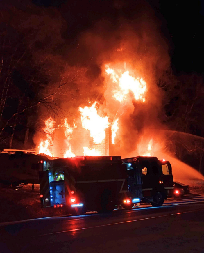
Fire & Rescue responds to the house fire in Wells River, VT.

What began as a simple “pet food” pantry has also grown into a “pet supply” pantry for people in crisis. When families lose everything, we can provide whatever they need—pet food, crates, beds, toys—as well as towels, blankets, pillows, and sheets for the humans who are starting over. Everything is given free of charge, because the last thing anyone in that situation should have to worry about is how to afford basic comfort.