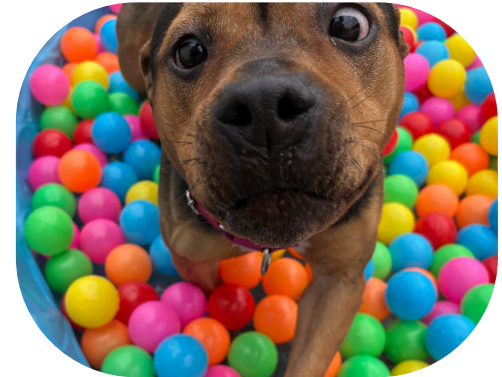
Snickers - 1.5y - Female - Smooth Brain, Big Heart

Join Our Team Full-Time Enjoy a career with purpose & great benefits!