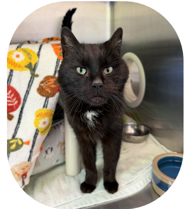
Jenkins - 12y - Male - House Panther

Less than 10% of our budget is paid for by adoption fees. We are almost entirely funded by the donations from our generous community. Mailing newsletters helps keep our supporters informed about how your donations are helping and what more can be done to improve the lives of Upper Valley pets and the people who love them!