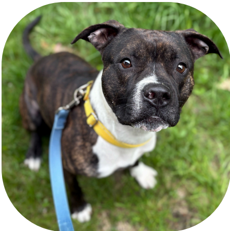
Saco - 1y - Male - Cutie-Patootie

We have a few dogs that have been overlooked for too long. All of the pets featured in this newsletter want to be part of a family and have a home to call their own. Please share their information with anyone in your circle who may be looking for a dog - hiking clubs, sports teams, coworkers - we know "the perfect fit" is out there for these pups, we just need to find them!