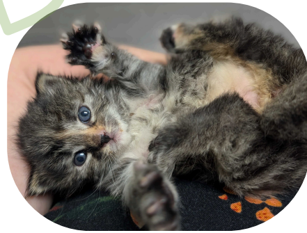
Chartreuce - 3w - Female - Available in 5ish weeks

Soft, smelly, and small - these treats are great for keeping active minds engaged and teaching important life skills while dogs await adoption. We *easily* go through 4, 16 oz bags of treats and a package of cheese or hot dogs every week!