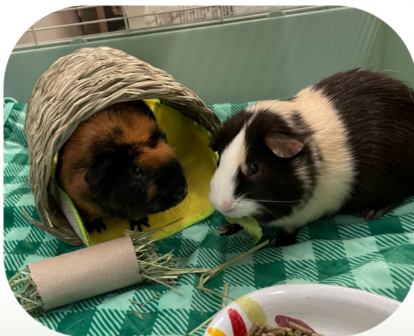
Rocco & Ricci - 1y - Male - Cuddly Bean Bags